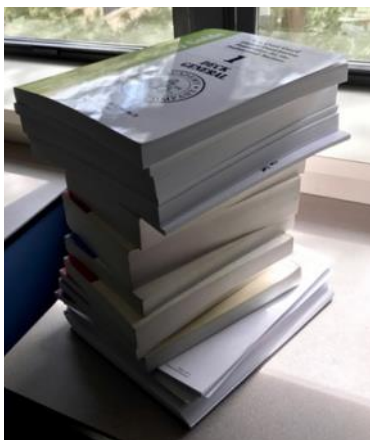
Study material for licensing!